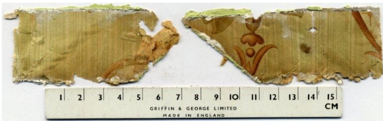
This was found behind the picture rail over a Victorian gothic window.

One of the most visible Victorian additions to the room were the cornice and picture rail, both made of wood. These had been fixed on top of earlier wallpaper.