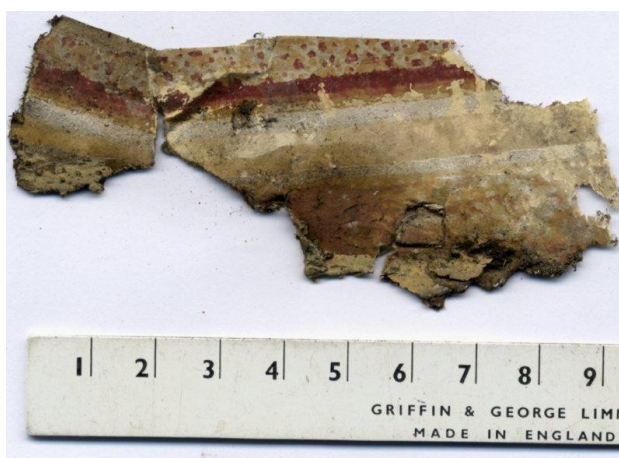
From behind the framework of the north-ish window.

At the north-ish end of the house is a sash window which appears to be older than the opening in which it sits. Looking at the construction of the surround, I think it was put into its current location during the Victorian renovation. An archaeologist who worked with old buildings suggested that the window was a lot older than its current surround.