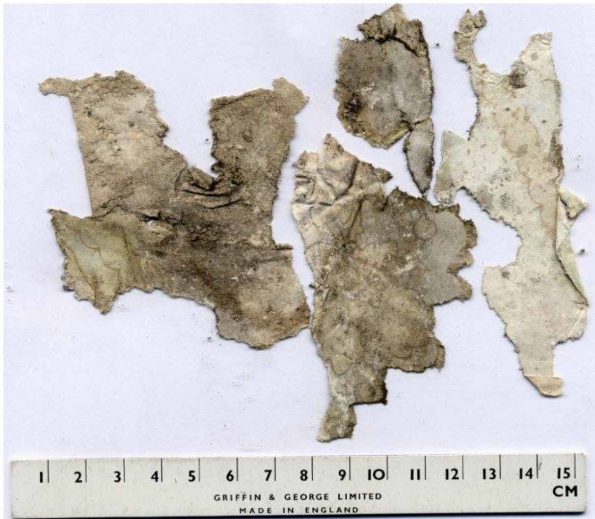
Wallpaper from under the plaster on the freestone fireplace.

Such fireplaces were not uncommon in Shepton [5 ft 8 1/2 inches wide, if my memory is correct, which it might not be]. The dressed stone had been wallpapered, pecked for plastering, plastered, lime-washed, and the hole partly filled in to accommodate the Victorian fireplace.