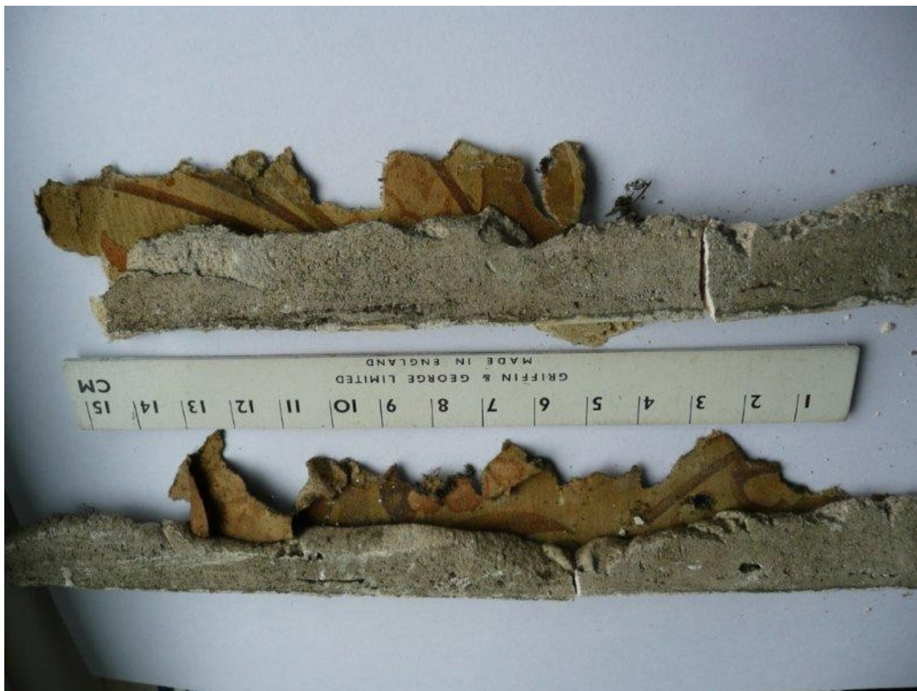
These samples were found behind the Victorian cornice over a Georgian window.

At the north-ish end of the house is a sash window which appears to be older than the opening in which it sits. Looking at the construction of the surround, I think it was put into its current location during the Victorian renovation. An archaeologist who worked with old buildings suggested that the window was a lot older than its current surround.