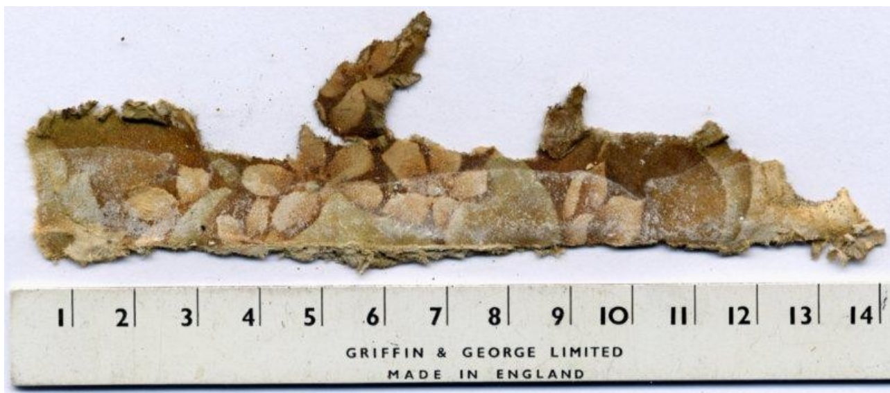
From above the end, or north-ish, window.

One more papyropsy was found in this room. This too came from by the north-ish window.